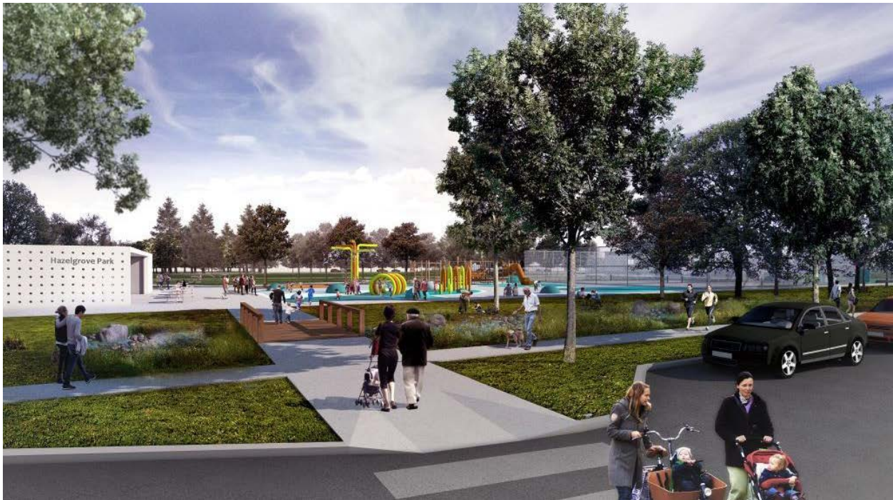
Rendition of pedestrian access into the park from 190 th St. at 71 st Ave. with a view of the bioswale, waterpark, and washroom.

The City of Surrey invites Expressions of Interest from professional artists or artist teams for a sculpture for a new park north of Hazelgrove Elementary School in East Clayton, Surrey.